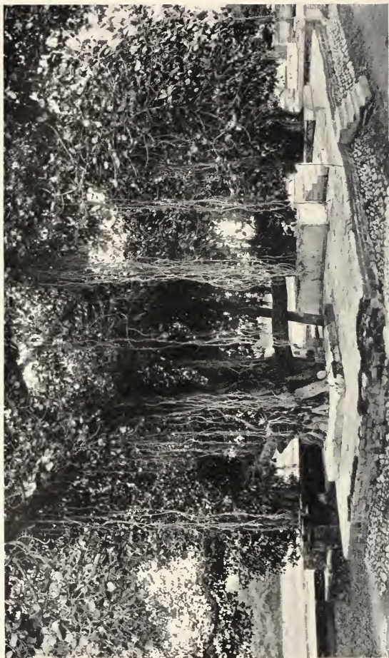
SACRED FIG TREE AND SHRINES.